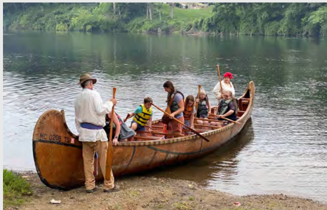
This birchbark canoe was made the way the Native people made theirs. It is on the St. Joseph River in Michigan

Because there were no real roads in Iowa (just narrow paths), the best way to travel was on the water. Iowa has the Mississippi River to the east and the Missouri River to the west, and many other rivers and lakes. The Native people had learned that the best way to travel was in a birchbark canoe. It was light and strong. It could carry many people and a lot of furs and trade goods! The French started using the birchbark canoe too—we say, they “adopted” the canoe from the Native people. In Iowa, people also made canoes out of logs.