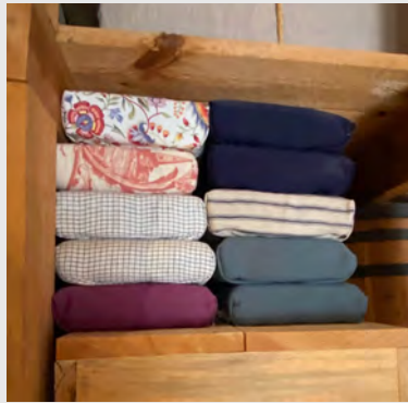
These are rolls (“bolts”) of cloth ready to be traded

The Native people in Iowa trapped animals for their furs. The most important one was the beaver. But they also trapped otter, mink, muskrat, and fox. And they also hunted deer and bears, and even bison (or buffalo), in many parts of Iowa! They could trade these furs and skins for trade goods from the French.