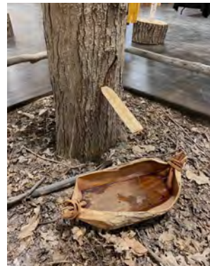
Reproduction of a maple tree being tapped for its sweet sap