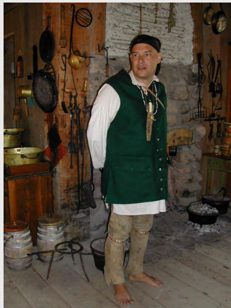
This man is wearing deerskin leggings under his long shirt and vest. He works at Colonial Michilimackinac in Mackinaw City, Michigan

The French also adopted some clothing used by the Native people. The Native men usually wore deerskin leggings, which were like pants with no tops to them. (They tied the leggings to their belts with straps to hold them up.) The leggings made of deerskin were very strong and it was good to wear them when the men were walking through the woods to protect their legs from branches and thorns. They were heavy, but they were stronger than pants made of wool or cotton cloth. So, the French men often wore leggings.