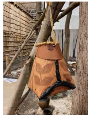
A bucket made of birchbark