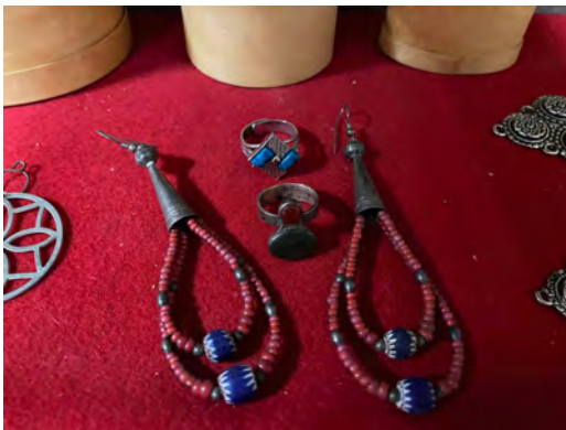
Rings, and beads made into earrings